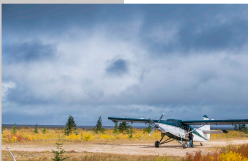
Brewing storms make for beautifully dramatic photos

And in an environment as stunning, but also challenging and unpredictable as the shore of the Hudson Bay, Jad will turn your thinking about bad weather on end. He'll have you talking about Hollywood light, shooting blue hour pictures and hoping for a storm.