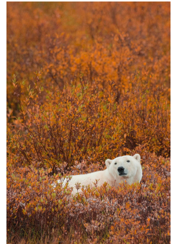
Make your subject pop

Jad will take photographers far beyond the hunt for that iconic polar bear shot and help you learn how to capture the full experience of your journey. Rather than get bogged down in technical talk about F-stops and shutter speeds, Jad focuses on things like the secret to finding a 'moment,' how to capture a full palette of color on assignment, and why detail shots are the most important (and easiest to make) photographs in any story, but are often the most overlooked.