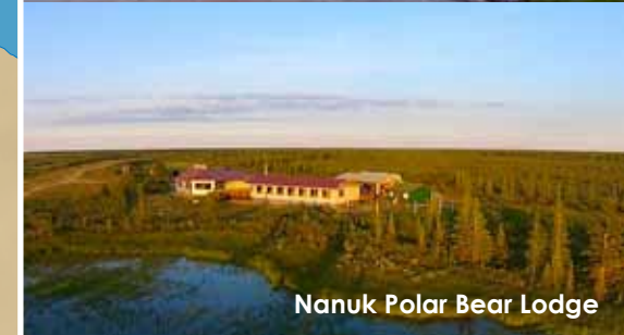
Nanuk Polar Bear Lodge