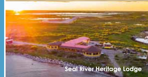
Seal River Heritage Lodge