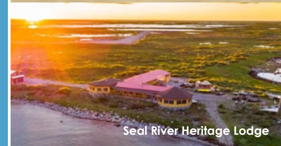
Seal River Heritage Lodge