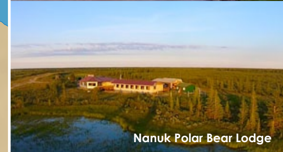
Nanuk Polar Bear Lodge